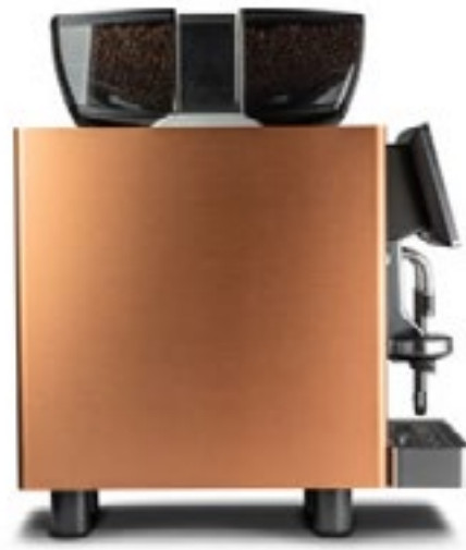
Enigma E'4 (ct, s, m)