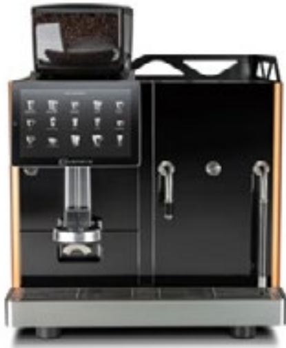
Enigma E'2 (ct, s, m)

The E'4s/Classic was the first machine conceived and produced by Eversys. It was built on the basis of a two-group machine. 56 cm wide and designed to produce 4 espresso at the same time with a powerful steam module.